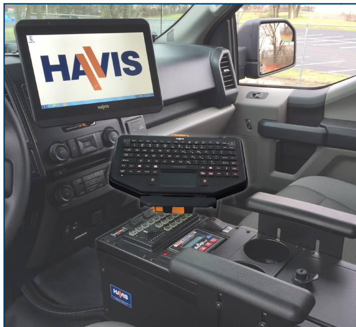
Includes Havis Rugged USB Backlit Keyboard (KB-101), and Patent Pending Keyboard Mount (C-KBM-201)