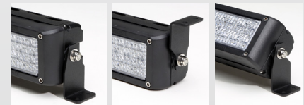
Universal bracket mounts in any position