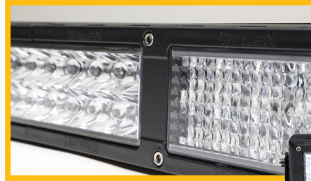
Combination spotlight and floodlight modules

The new Continuum lightbar is engineered to bring Whelen's advanced Super-LED technology to off-road applications. Solid state electronics and hard coated lenses are designed to withstand harsh environments while interchangeable modules and advanced optics give your vehicle the reliable performance and power Whelen is known for.