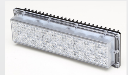
Each individual lighthouse is waterproof