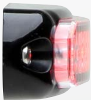
Micron low-profile side view