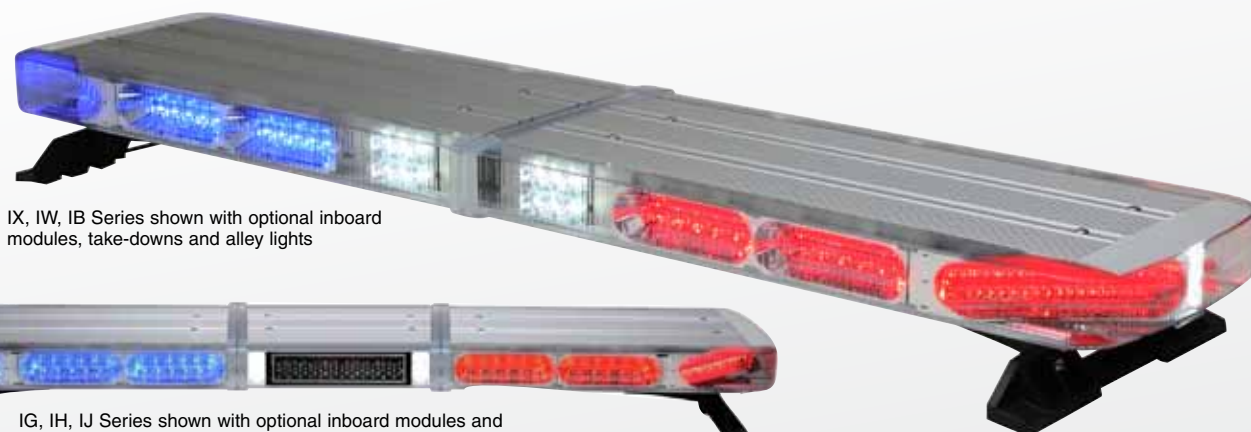
IX, IW, IB Series shown with optional inboard modules, take-downs and alley lights

Redesigned and reinvented for exactly what your fleet needs, the new Liberty II builds on the Liberty's reputation for excellent reliability and performance.