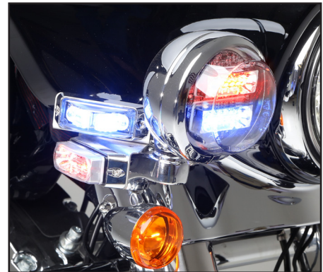
Front passing/fog lamp kit available in 90° or 90° and 45° models. Includes flange.