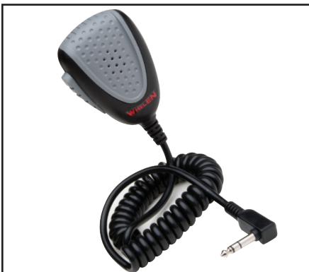
Noise Canceling Microphone