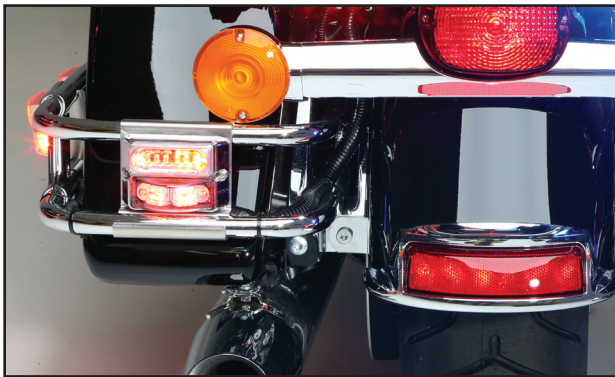
Rear (Harley-Davidson OEM Saddlebag) Crash Bar Mounting Kit allows for easy mounting of two lightheads. Includes flange.