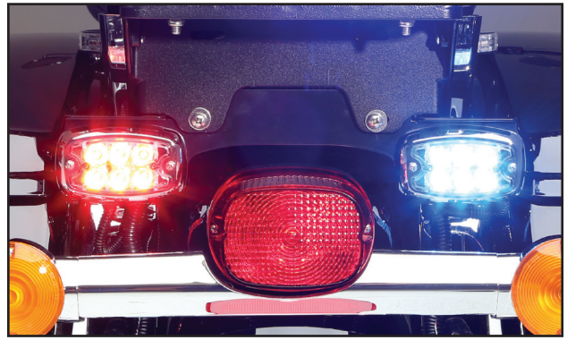
License Plate Bracket for horizontal mount of two lightheads.