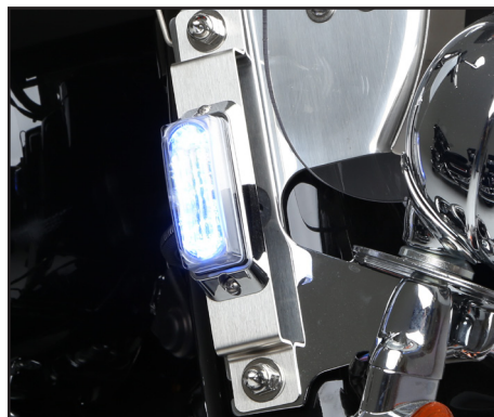
Side Fork Mounting Bracket Kit allows for easy mounting of one lighthouse. Includes flange.